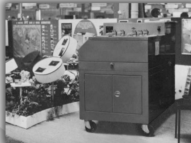
Bauer Booth at the Paris Airshow, 1967

Bauer's early years as a Hartford, CT-based manufacturer of high quality and reliable industrial products, set the stage for our steady, long-term growth. With the dawn of modern aviation, Bauer established itself as a sought-after provider of support and test equipment. Our temperature simulator product line quickly became the industry standard.