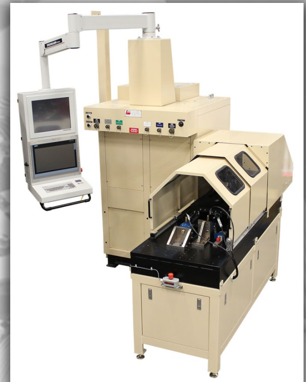
Bauer Senior Electrical Engineer Pete B. on the Actuator Test Stand:

"The Bauer Actuator Test Stand platform is designed to offer maximum flexibility for adding new component capability when needed. In particular, with the Bauer approach, our customers can add new capability easily and self-sufficiently."