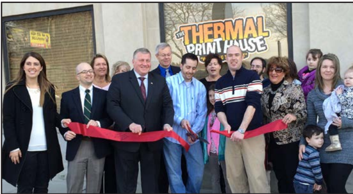
Ribbon Cutting at The Thermal Print House