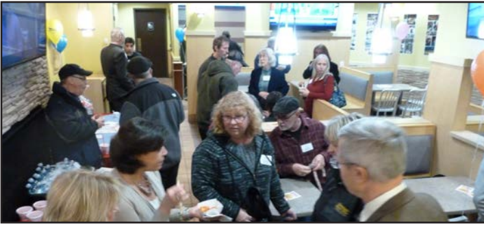
Business After Hours hosted by Sonic