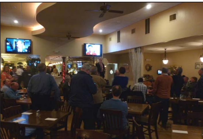
Business After Hours hosted by Marilyn's Pub

For more pictures of our events, visit Facebook.com/CentralCTChambers