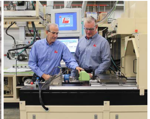
Then & Now - The past and present at Bauer, Inc.